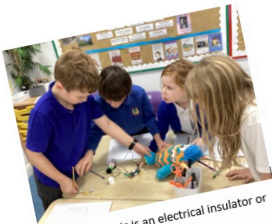
Testing if fabric is an electrical insulator or conductor

In music this term, Squirrels have been rocking and a rolling. They have had great fun with learning the hand jive, and performing together a rock and roll piece. They can identify that a bass line is the lowest pitch line of notes in a piece of music, and have been 'walking the bassline' where patterns of notes go up then down again, which is common in rock and roll music.