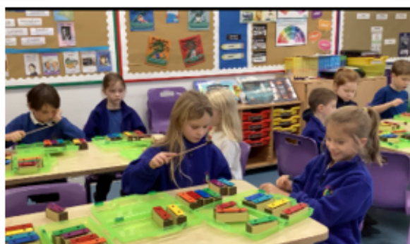
Walking the bassline