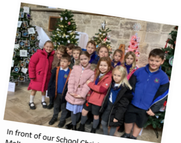
In front of our School Christmas tree at Melton Christmas Tree Festival