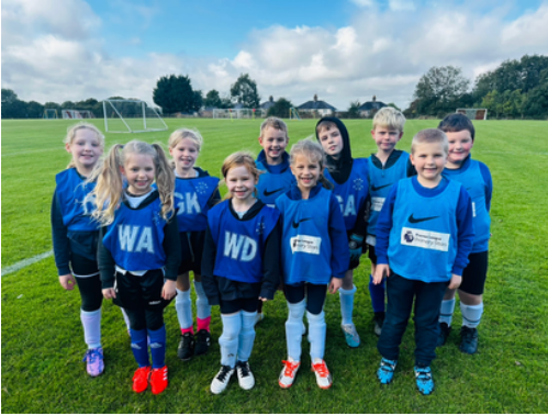
Our Y3 & 4 Mixed Football Team

So far this year children in each class have had the opportunity to take part in additional sporting events where they have the chance to interact and compete with other schools. These events support the development of so many skills, not just sporting and are thoroughly enjoyable! Our aim is to continue to provide at least 3 events across the year for each child in years 1 to 6. They are certainly popular with the children!