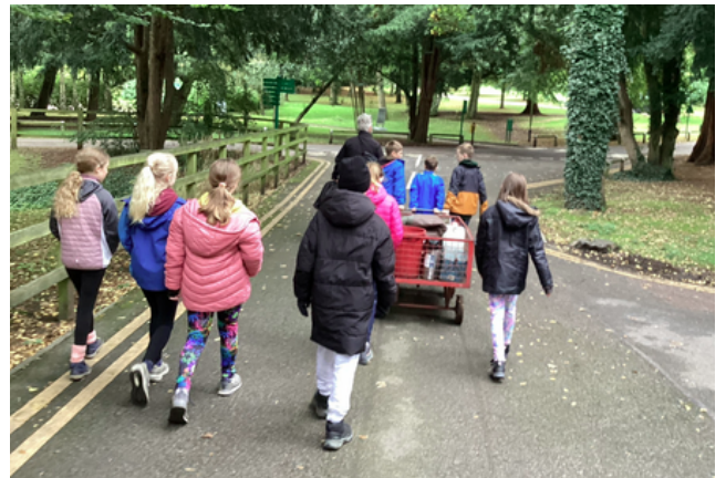
A few pictures from our residential trip!